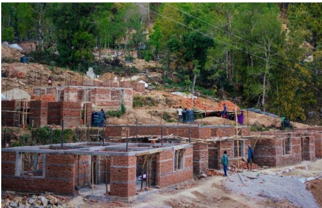
Construction is taking place in Dansing of Nuwakot district where 350 homes that were severely affected by the earthquake are being rebuilt.

We have started building more than 1,600 earthquake-resistant houses. Almost all of the families involved have received the first installment of conditional cash support for the construction. Some 1,000 households received the second installment and another 200 received the third and final installment to complete construction.