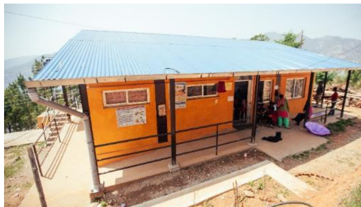
The new pre-fab Taruka health facility in Tarakeshwor rural municipality in Nuwakot district includes a birthing center and receives approximately 20 patients every day.