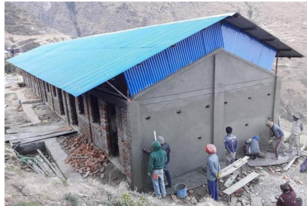
Grey Lower Secondary School (seen here under construction) has now been completed. This school in Rasuwa will welcome over 200 children.

These health facilities will provide services to more than 70,000 people.